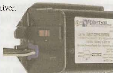
( Figure A )