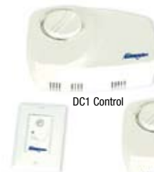
TR3 Timer Control